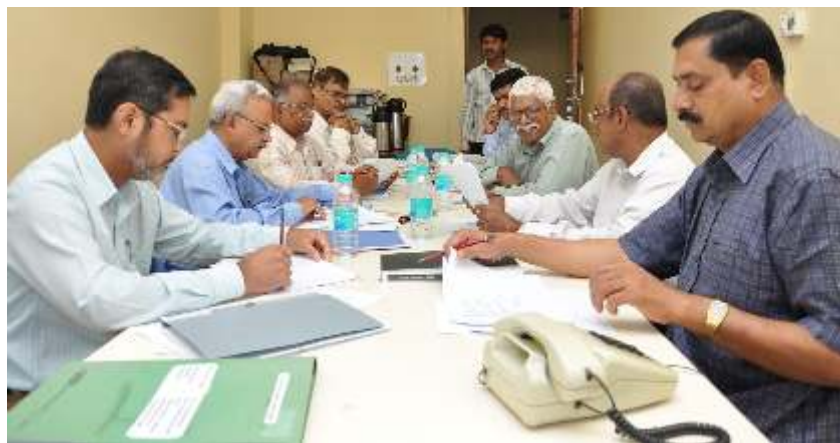
A view of the committee members short-listing the applications

4 th September 2009 at NTS H.Qrs., Mysore