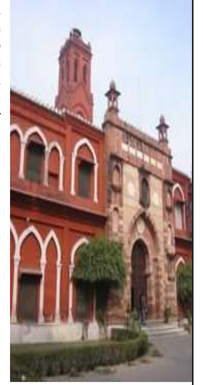
Victoria Gate, Aligarh Muslim University, Aligarh