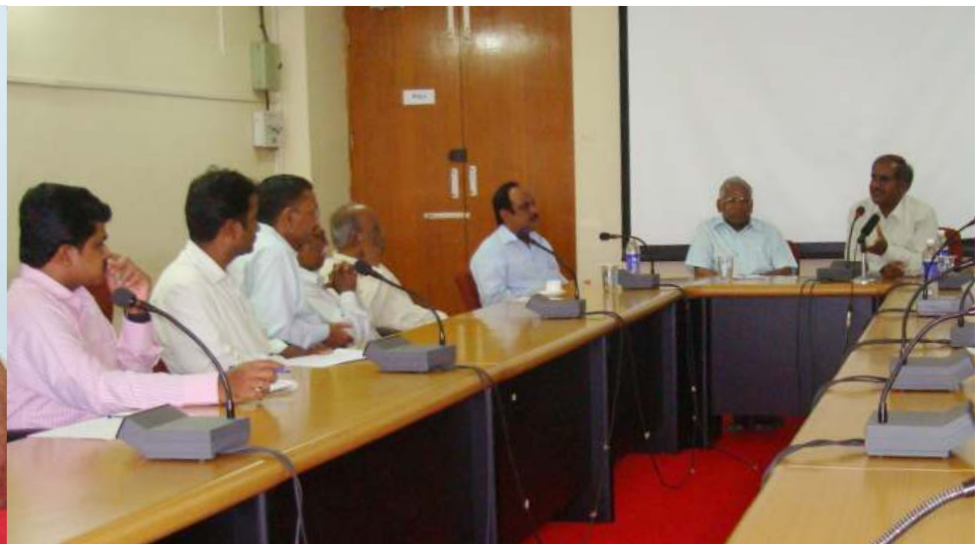
NTS team with the dignitary during the interactive session