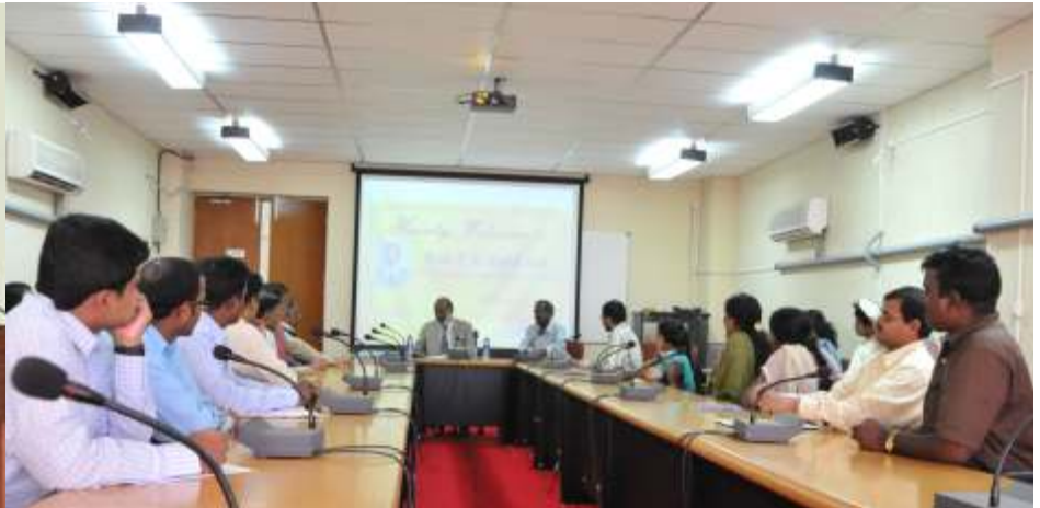
NTS team with the dignitary during the interactive session