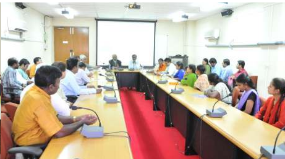
NTS team with the dignitary during the interactive session