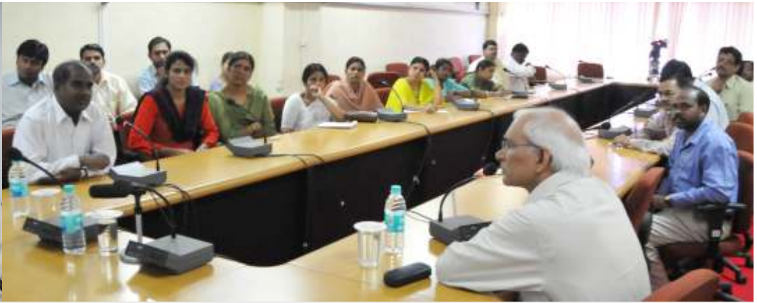
NTS team with the dignitary during the interactive session

institution in the country, which has gone so much deep into the subject and this is indeed very laudable and I'm delighted. I do hope that your organization certainly will grow and I would expect that this organization must take the shape of National Evaluation Organization. Till now this type of work has not been done either by UPSC or SSC or by IBPS but only by NTS which is laudable.