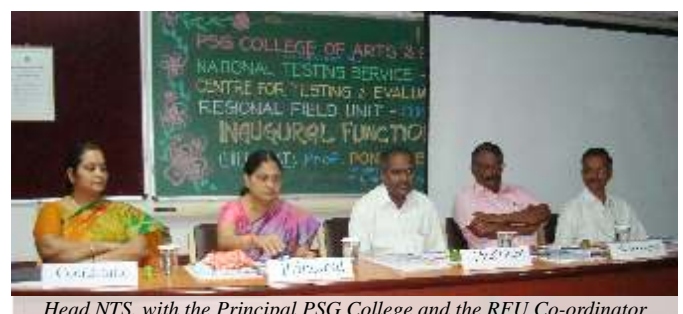
Head NTS, with the Principal PSG College and the RFU Co-ordinator