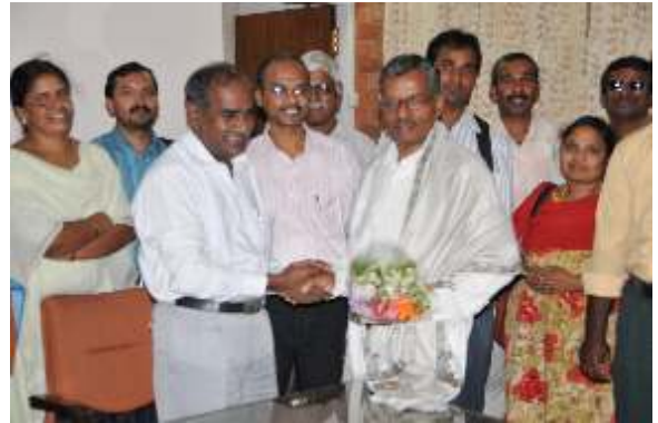
NTS team felicitates the new VC, UOM, Mysore